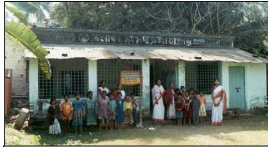
Students outside VESC's classroom

Vivekananda Educational Society (24 Parganas Dist., W. Bengal) - The education of 350 child labourers was in jeopardy