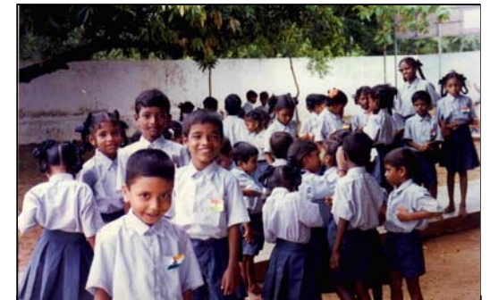
Students at MSMF