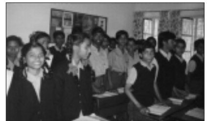
Children at the Bustee Welfare Center, an Asha* project in Calcutta.

The feeling of team spirit is perhaps the best outcome of all the hard work that goes into making a successful fundraiser. The effort draws all Asha volunteers together and renews their commitment to the cause of education!