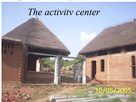
The activity center

Meenakshi's house and the school are all thatched structures! We had also just finished thatching another building which was to be a hostel for children whose parents work in the quarry industry..