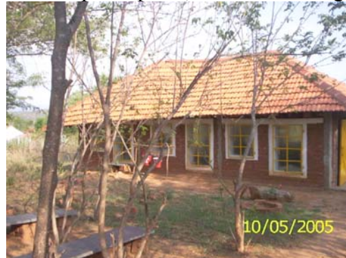
The new school building

Once all of us had settled back into some routine, we were able to think about taking the children out on study visits to other schools.