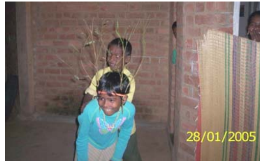
The proud antelope