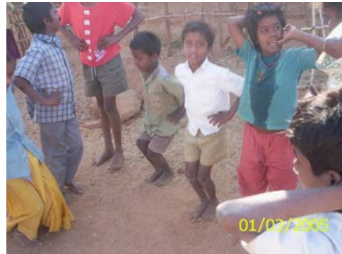
Learning to dance