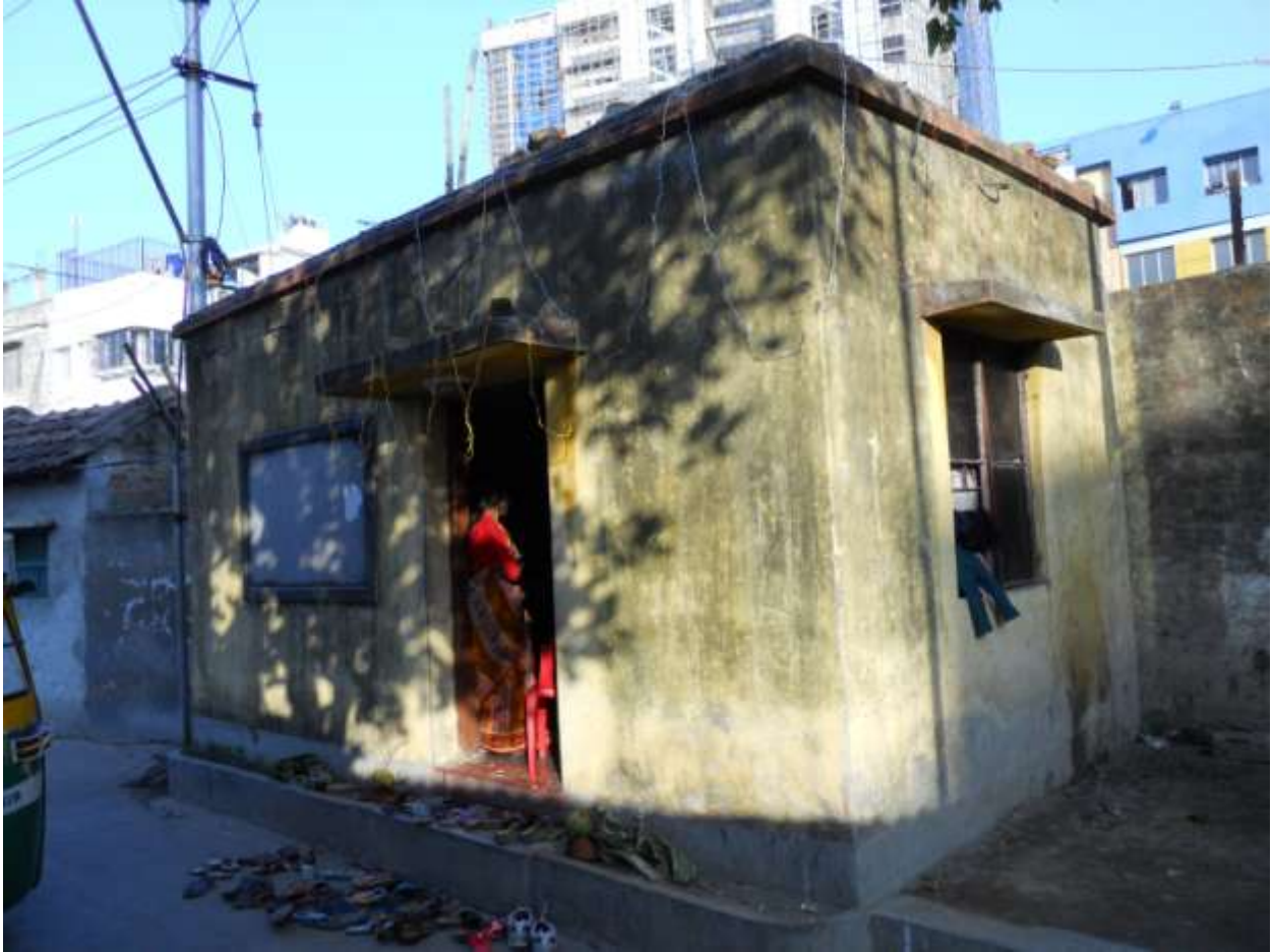
The MarutiBagan center. It operates out of a club house. The room is pretty small. Most of the centers work out of really small club rooms.