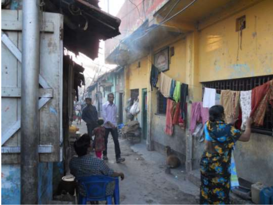
Right outside the Tiljala Center.