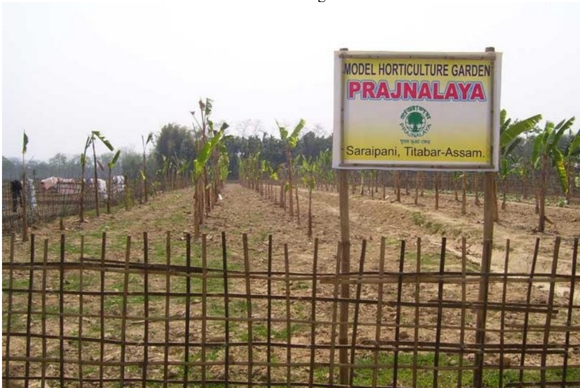
Horticulture garden- Prajnalya, January 2009

Part of this initiative is to establish a Horticulture garden.