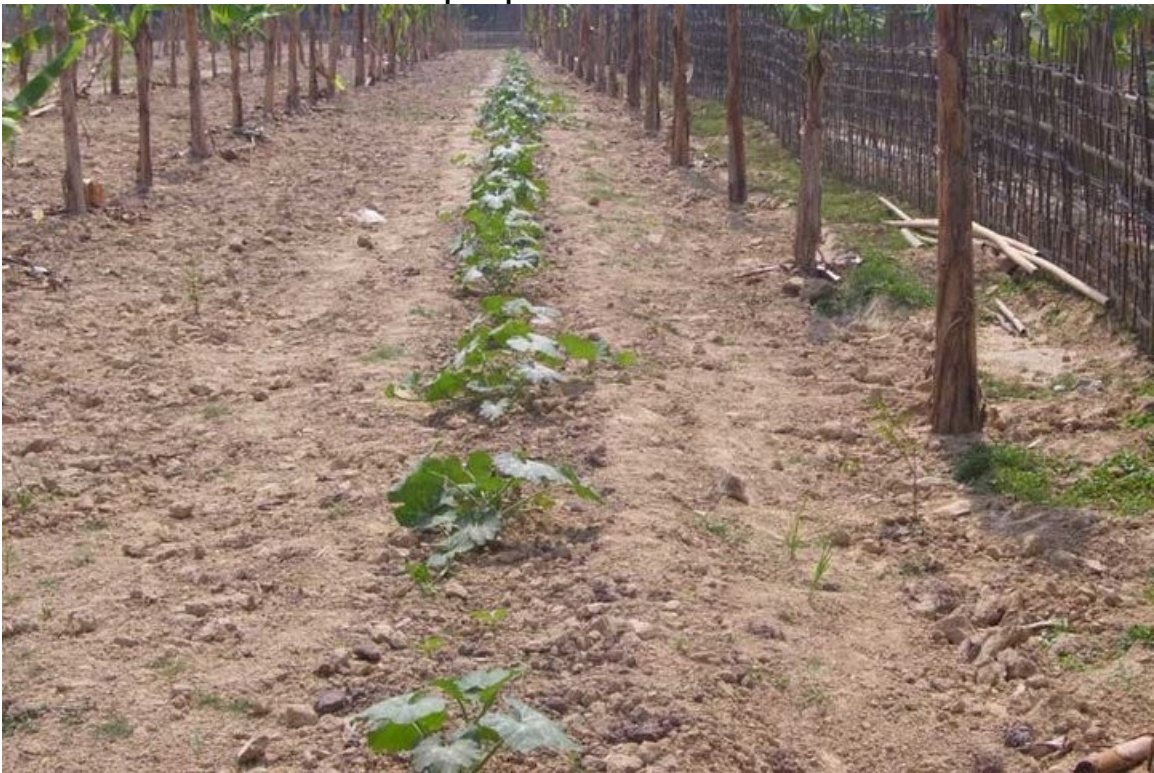
450 Pumpkin plants are planted between the Jahaji banana and Orange plants.