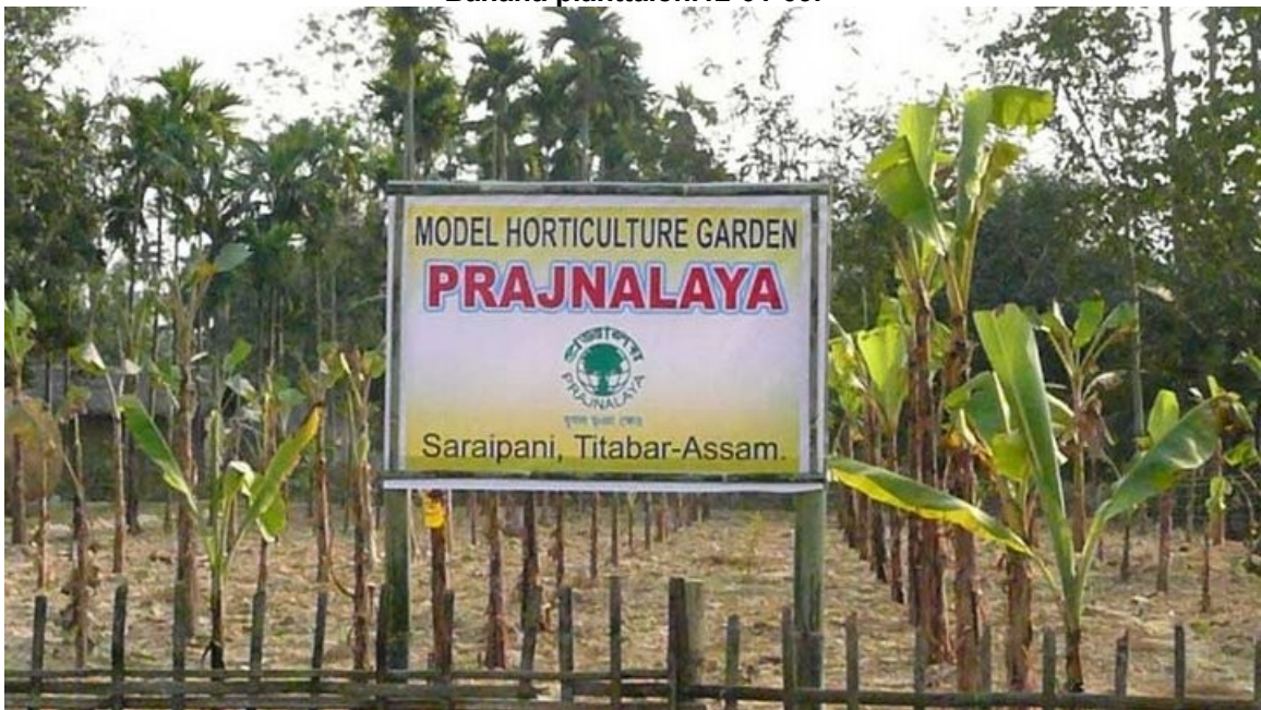
Plantation of "Jahaji" banana plants. 12-01-09 "Jahaji" is local banana variety.