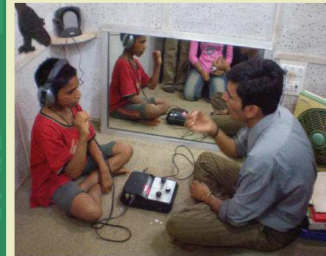
Audio Visual Training. Teacher on the right using visual simulation, student using audio aid.

Nilesh L. Murdeshwar Karnbadhir Vidhyalaya (Deaf and Mute School) at Jawhar, Thane District of Maharashtra is a residential school run by Pragati Pratisthan. Children from 25 villages in neighboring districts come to this school. About 65 deaf and mute children receive education from K.G. till 4th standard in this school. This school provides hostel facility for both boys and girls but school is lacking in funds to provide hygienic food and environment. The school is also lacking in basic infrastructure like hearing aids, Audiometers, pictorial books, computers etc., without those facilities it is hard to