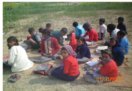
Children at an open class

Project Muskan is for the education of physically challenged children (mainly affected by polio) from villages around Varanasi. Detailed reports provided by the officials and Asha contacts/representatives in India, show that the funds are being properly utilized and a good number of children are getting benefitted from it.