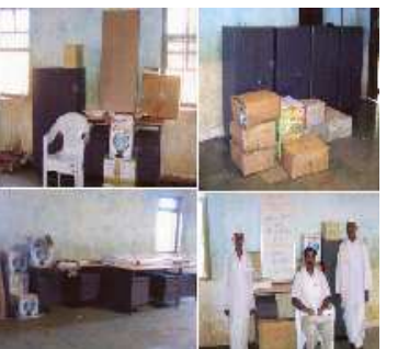
School Infrastructural photos