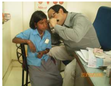
Student check-up by a physiotherapist