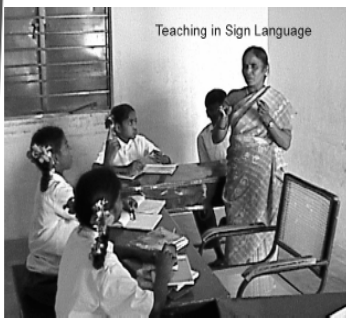
Teaching in Sign Language